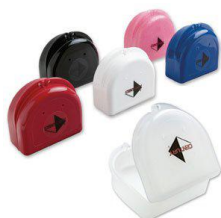
Mouth Guard Case